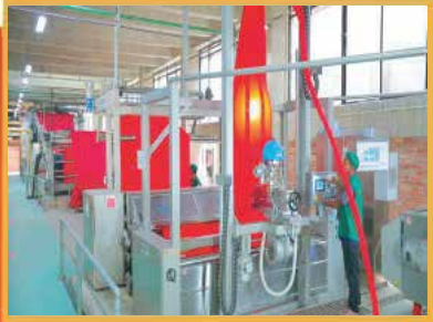
SQUEEZER Brand: Bianco Country Of Origin: Italy CAPACITY: 10,000 Kg/day