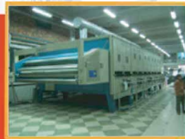
Relax Dryer Brand: Canlar Country Of Origin: Turkey CAPACITY: 10.0 Ton