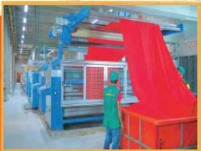
STENTER Brand: Bruckner Country Of Origin: German CAPACITY: 10,000 Kg/day