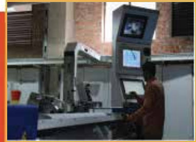
SLITTING Brand: Bianco Country Of Origin: Italy CAPACITY: 10,000 Kg/day